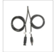
1.5m Cable with MC4 connector