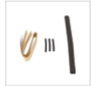
Heat shrinkable tube