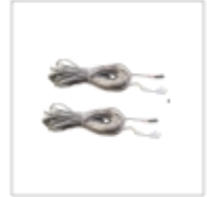
Water level sensor