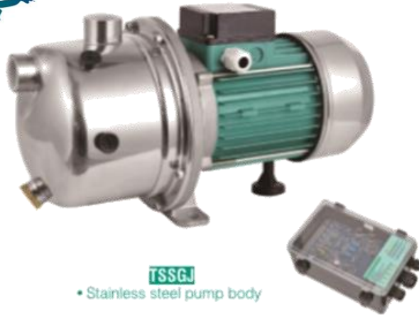
TSSGJ • Stainless steel pump body