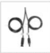
1,5m Cable with MC4 connector