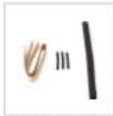
Heat shrinkable tube